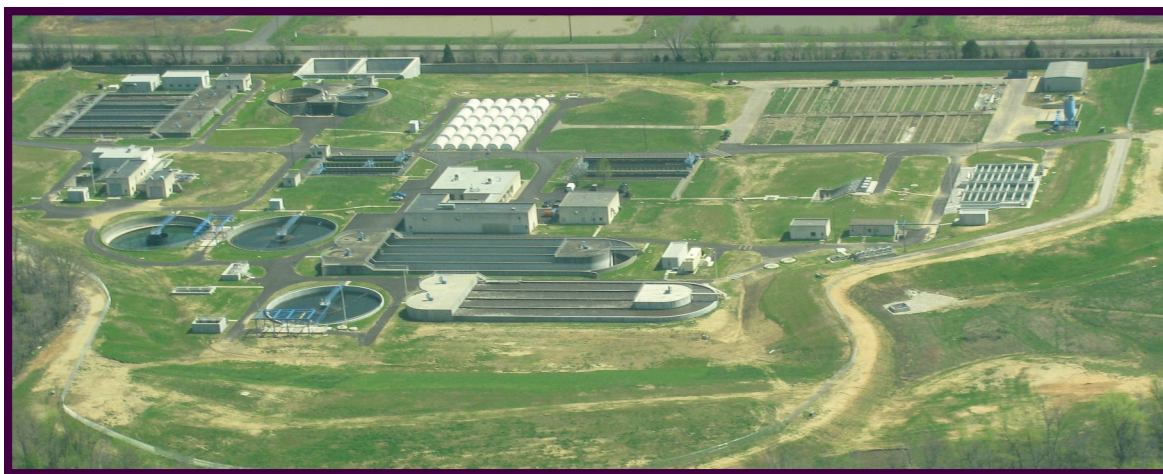
Elizabethtown Wastewater Treatment Plant

Water service is provided by the Hardin County Water District #2. Wastewater and natural gas services are also provided by the City of Elizabethtown. Natural gas service to the Glendale site is provided by LG&E Energy. All utility providers can provide detailed quotes based on projected usage.